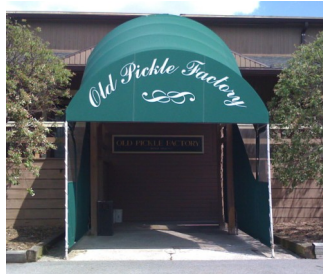
The Project Solvers' office is located at The Old Pickle Factory, Suite 216A, in Pittsford.

Welcome to our October newsletter! September was a busy month for us and October promises to be even moreso. Being busy might be a condition that can cause defects so we need to proceed quickly, but with caution. Which brings us to this month's topic. We are continuing our Quality theme with a topic that dovetails very nicely with last month's quality theme on six sigma: Cost of Quality. COQ is in fact a six sigma tool and you'll also see it in the PMBOK (page 195 to be exact).